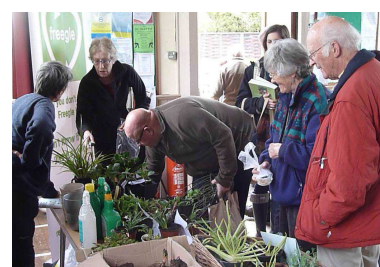
Bolton Launch Event

The project has received press coverage in local papers and two articles have been published nationally. As a result, Freegled seeds have been posted across the country and indeed to Canada and Australia as well.